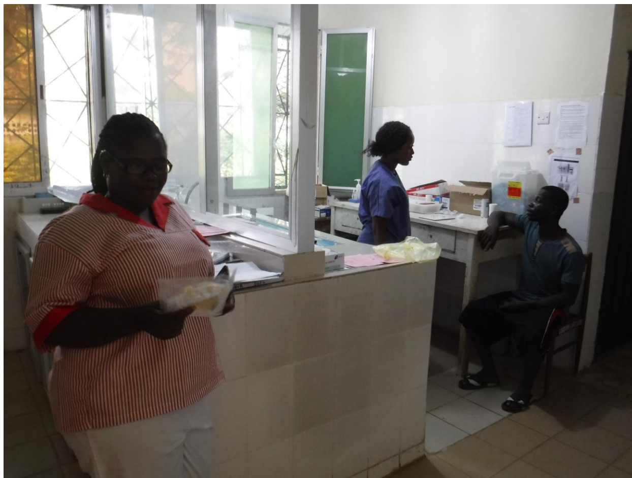
Catholic Hospital Mabesseneh - Lunsar specimen collection site