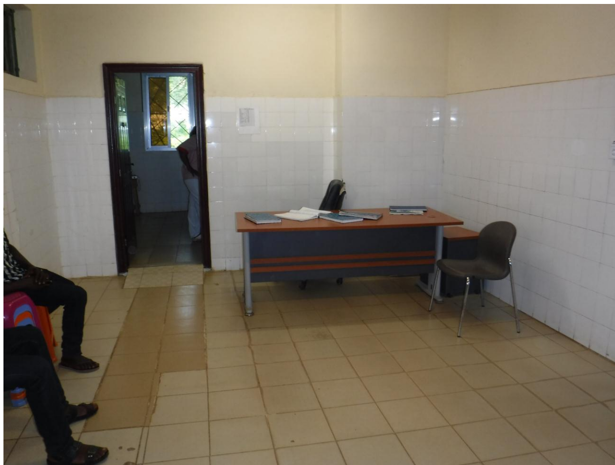
Catholic Hospital Mabesseneh - Lunsar Laboratory reception