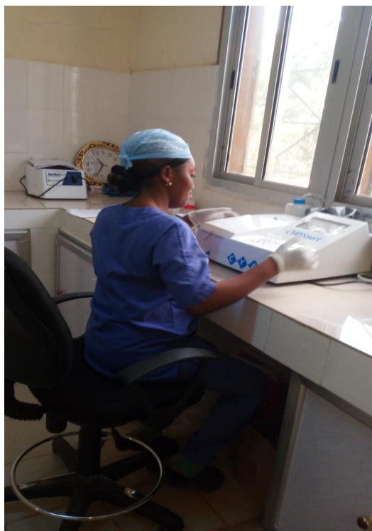
A staff operating the Biochemistry Machine

Saint John of God Catholic Hospital Mabesseneh - Lunsar