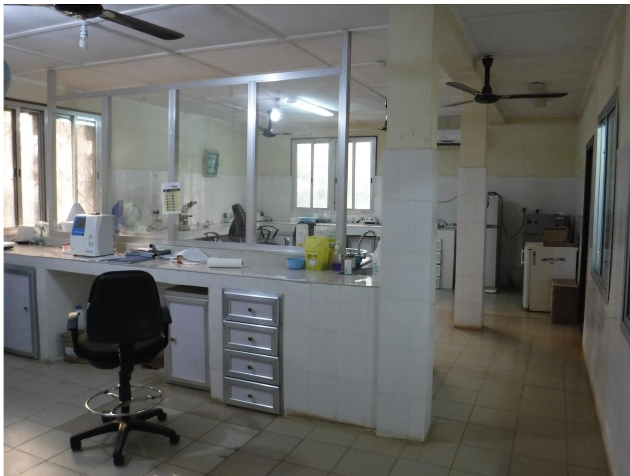
Catholic Hospital Mabesseneh - Lunsar inside view of the renovated Laboratory