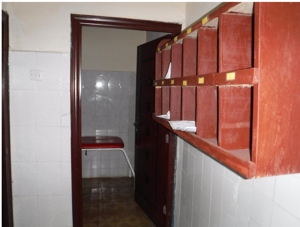
side view of laboratory results shelf and bleeding site far inside