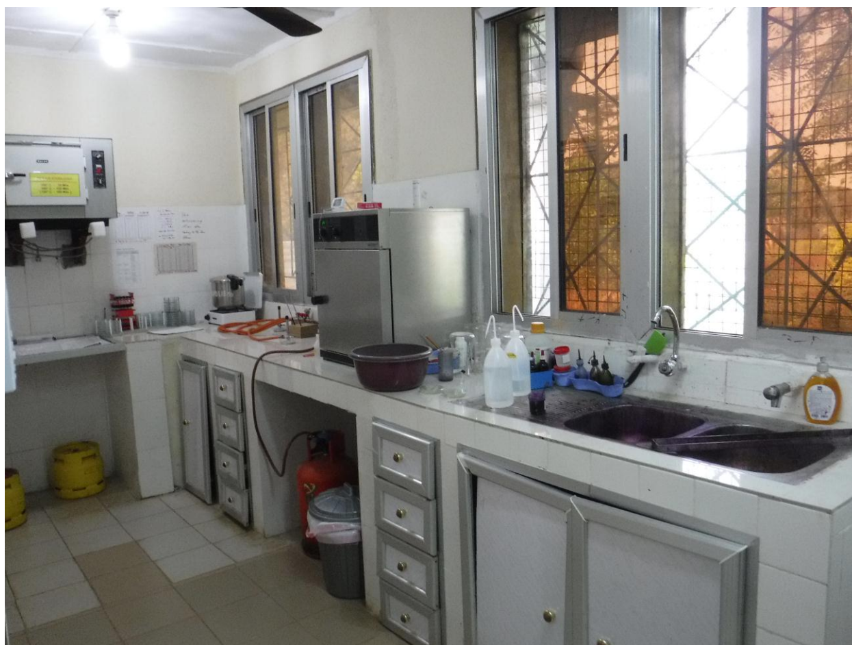
Catholic Hospital Mabesseneh - Lunsar Microbiology section